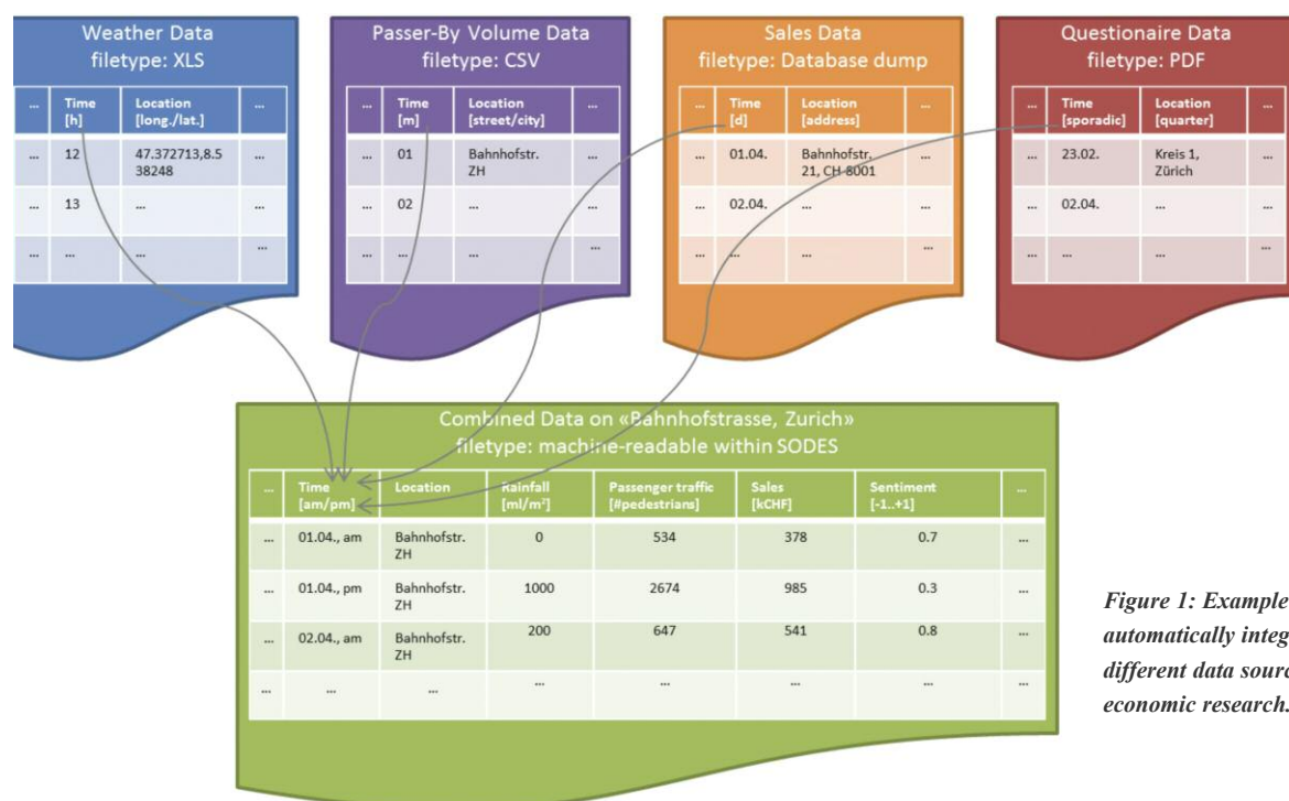
Figure 1: Example of automatically integrating four different data sources for socio-economic research.

Such a business model could consist of offering automatic data curation as software-as-a-service for open data. In order to comply with open data standards, the access to the data itself has to be free, while additional services could be offered on a freemium basis. To be of interest to industrial customers, private installations to curate confidential internal data could also be offered.